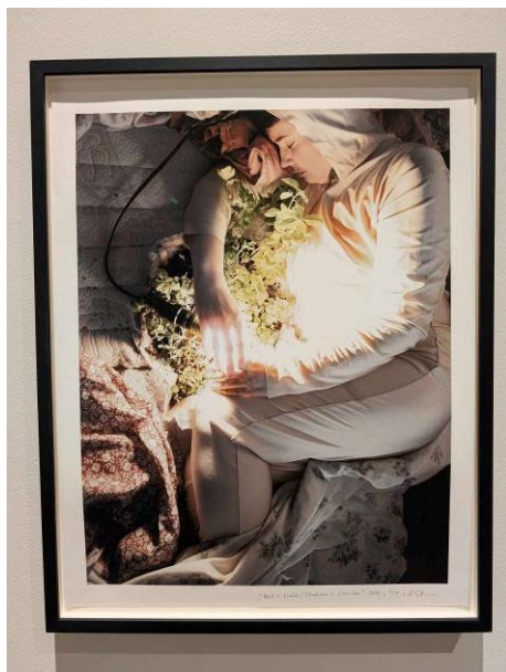
Laura St. Pierre, Heat and Light

archival inkjet on Hahnemuhle photo rag paper, 61.0 x 48.3 cm