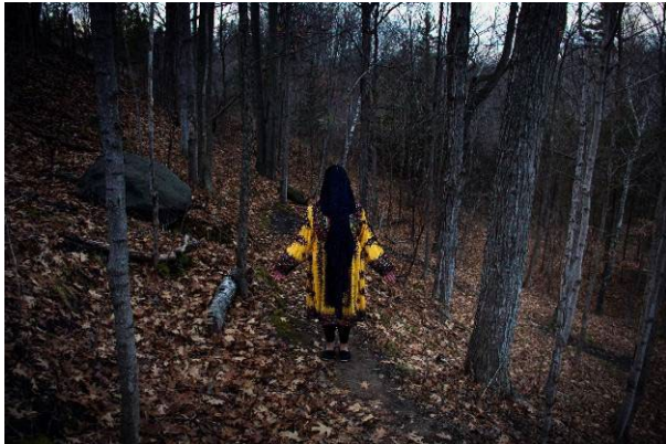
Mariam Magsi The Echoes Within digital C-print 73.5 x 93.7cm 2019 Collection of the Artist