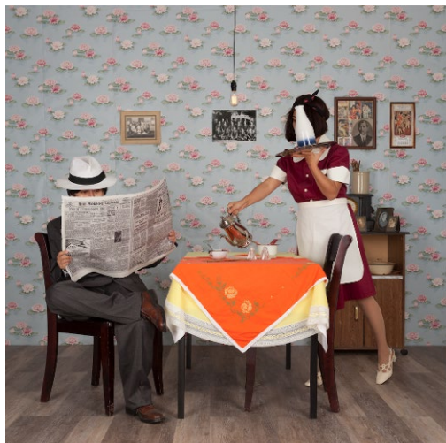
Xiao Han Yee Clun's Lost Story I digital C-print 63.4 x 53.3 cm 2017