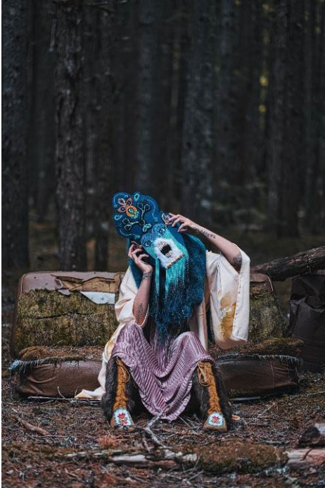
Catherine Blackburn, Unsettle I digital C-print 93.7 x 73.5 cm 2020