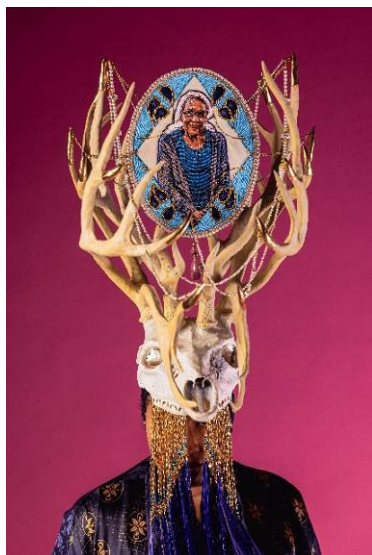
Catherine Blackburn Ancestor Dreamin' digital C-print 93.7 x 73.5 cm 2022